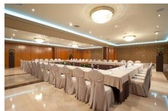
Room Vivaldi ( Meeting )