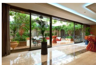
Garden ( Coffee-break )