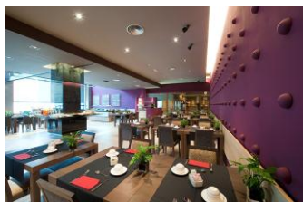
Rest. L'Aria ( Breakfast )