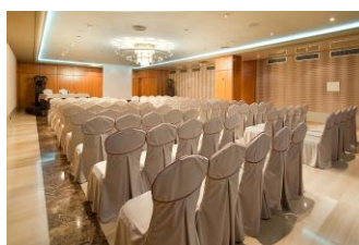
Room Diamant ( Theatre )