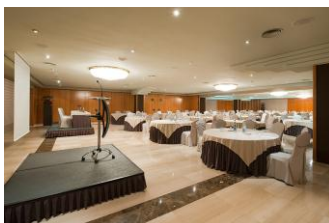
Room Rubí-Zafir ( Cabaret )

The set-up of chairs and tables is included in the rental fee of the meeting rooms. All set-up styles, except theatre, include: pads, pens, mineral water and candies. The AV equipment is not included in the meeting room rental fee, but they are provided with the latest AV technology, ADSL and wi-fi internet connection. Should you need any of these services, please contact our groups department for a quotation.