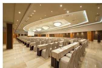
Room Verdi ( School )